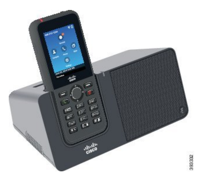
Figure 1: Cisco Wireless IP Phone 8821 and Cisco Wireless IP Phone 8821 and 8821-EX Desktop Charger

If your phone has a protective case, you don't need to remove the case before you charge the phone in the desktop charger. You adapt the charger to fit the phone.